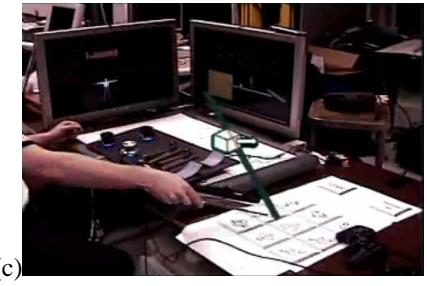
Figure 1. Videomixed view through another user's tracked, see-through, head-worn display. (a) Lines show the data flow between tracked input devices and virtual objects. (b) Untracked input devices are shown as screen-stabilized models. (c) A tracked wand is used to reconfigure the data flow network.

for aspects of an application a user might want to manipulate, while the 3D transformations are placeholders for more general operations a user could perform on them.