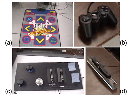
Figure 3. Input devices used in our prototype: (a) Dance mat. (b) Game controller. (c) Wand with attached Inter-Sense 6DOF tracker. (d) Tracked board with PowerMate sensors (left) and MIDI sensors (right): sliders and bend sensors attached to playing cards.

The data flow between the components relies on two different mechanisms. Within each framework, we use the framework's native communication protocol: CORBA (Common Object Request Broker Architecture) events for DWARF, and UDP (User Datagram Protocol) for Unit and DP. Across framework boundaries, we also use UDP, which has proven to be a simple, yet viable solution. We run Unit and DP frameworks on Windows XP Professional, and DWARF on SuSE Linux Professional 9.1.