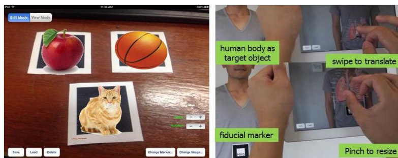
Figure 1. Simple Authoring Tool (left); Sample Use of the Authoring Tool (right)

Figure 1 shows the interface for our simple authoring tool for teachers and a sample use case. In this example, teachers can download any image from the internet. This image is converted into a texture on the screen. Using gestures like swipe, pinch, and so on, the teachers can modify the appearance of the image. In this example, it is desirable to scale and position the lungs correctly on the body.